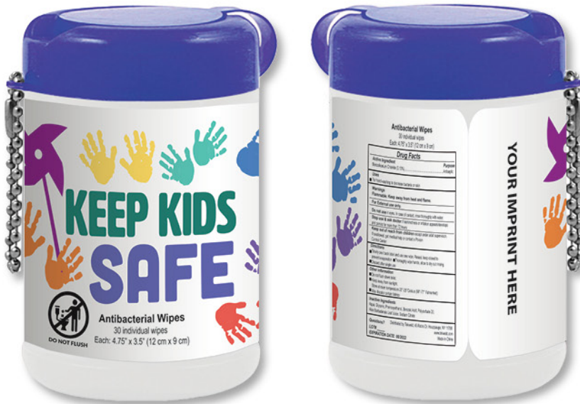
4433 - CHILD ABUSE AWARENESS WET WIPES SHOWN WITH BLUE LID