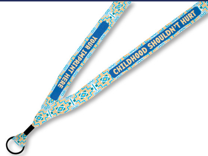
4547AN - ROCOCO AWARENESS LANYARD - NATIVE TEMPLATE: CA-01