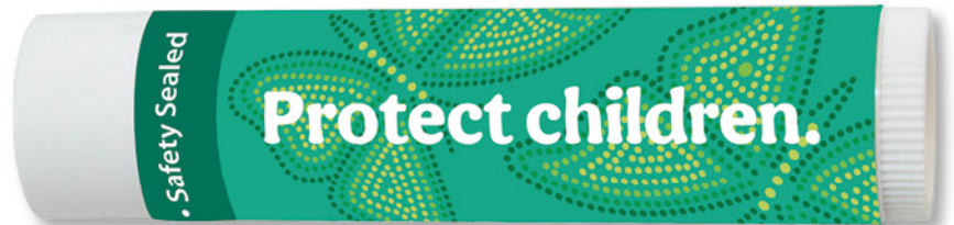
1745AN - AWARENESS LIP BALM - NATIVE TEMPLATE: CA-01