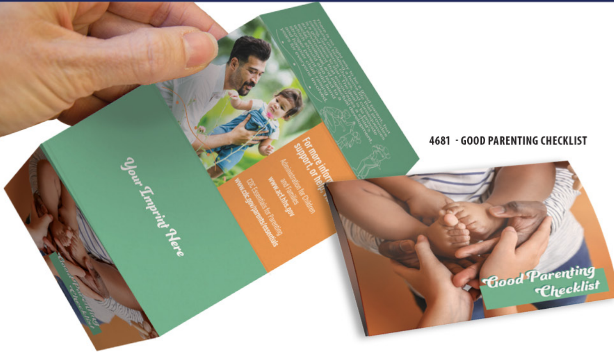
4681 - GOOD PARENTING CHECKLIST