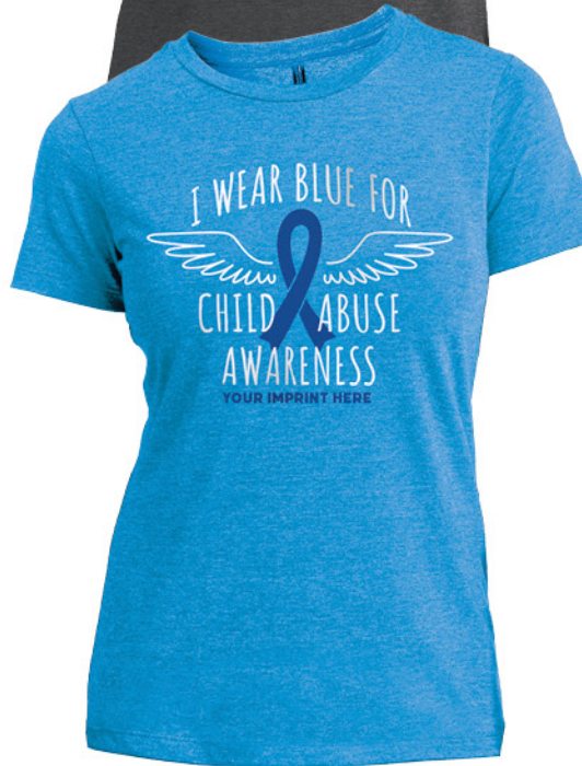
4581CA - WOMEN'S CHILD ABUSE AWARENESS T-SHIRT TEMPLATES: CA-07, CA-06 Shown on Heathered Charcoal and Heathered Turquoise