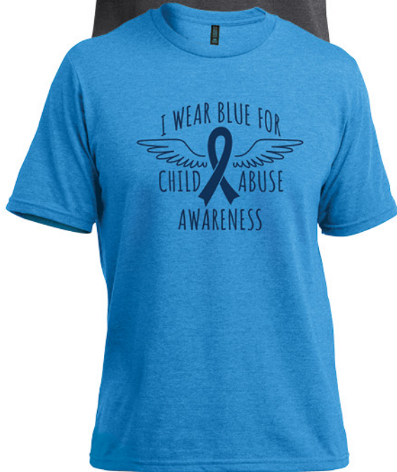
2674C - UNISEX CHILD ABUSE AWARENESS T-SHIRT TEMPLATES: CA-08, CA-12 Shown on Heathered Charcoal and Heathered Turquoise