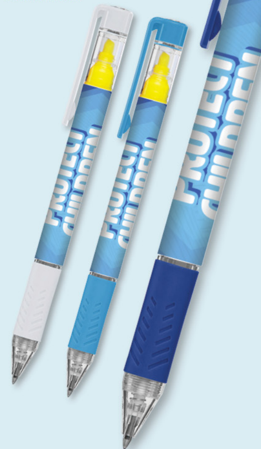
4649A - AWARENESS HIGHLIGHTER AND PEN TEMPLATE: CA-01