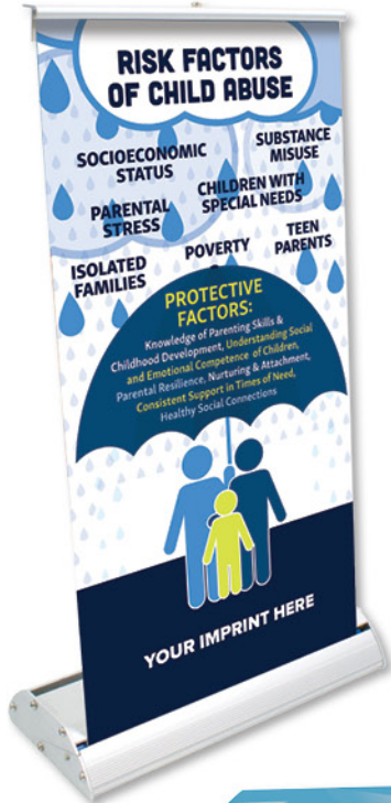
2197CA - CHILD ABUSE PREVENTION MINI RETRACT-A-BANNER TEMPLATE: CA-02