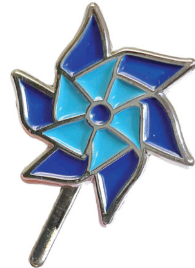
3870 - CHILD ABUSE PREVENTION PINWHEEL PIN